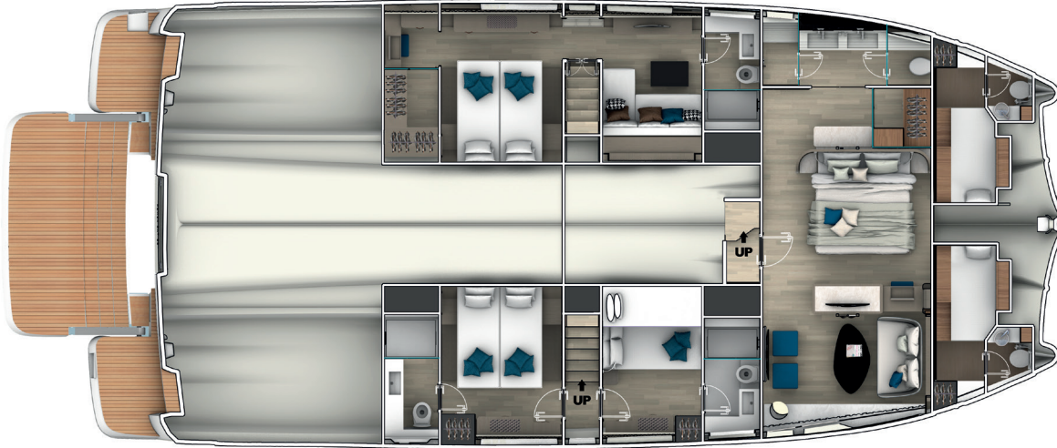
Galley up layout: 4 staterooms / 4 bathrooms