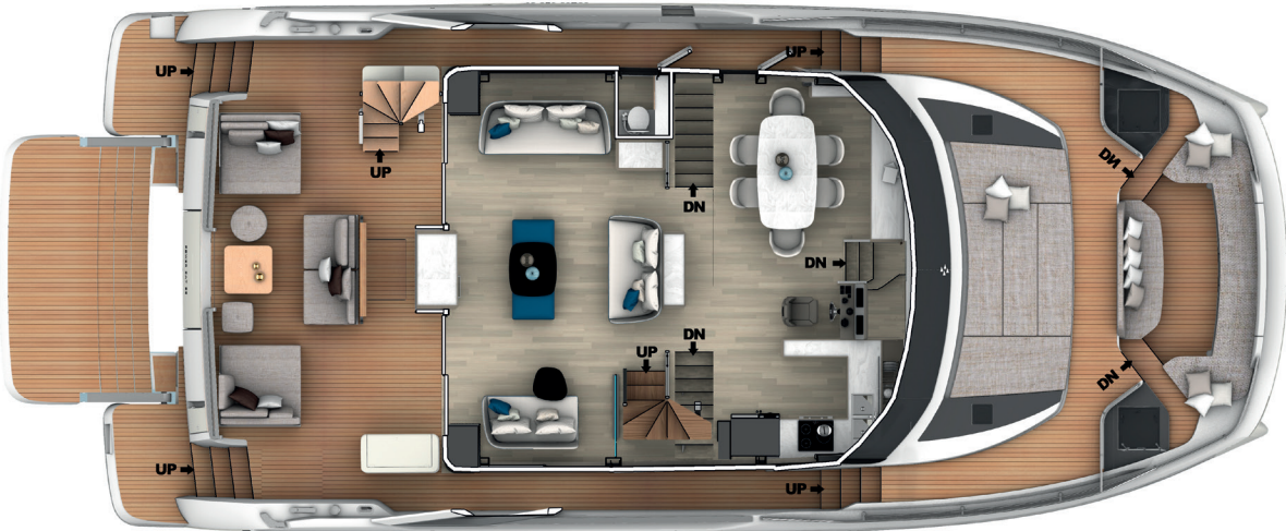
Galley up layout