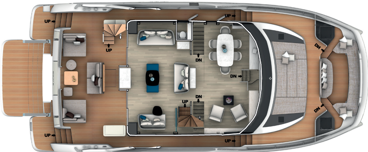
Galley down layout